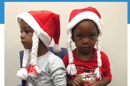
Waiting for Santa.

Our emergency day on Christmas Eve saw over 15 families. They were all provided with toys, clothes and grocery gift cards as well. Our volunteers (or 'Elves' as they like to be called) are the reason that this program runs so smoothly and effortlessly every year. Dedicating themselves to the long hours and weekend drop-offs, the Elves ensure that all our families and seniors have a magical Christmas memory.